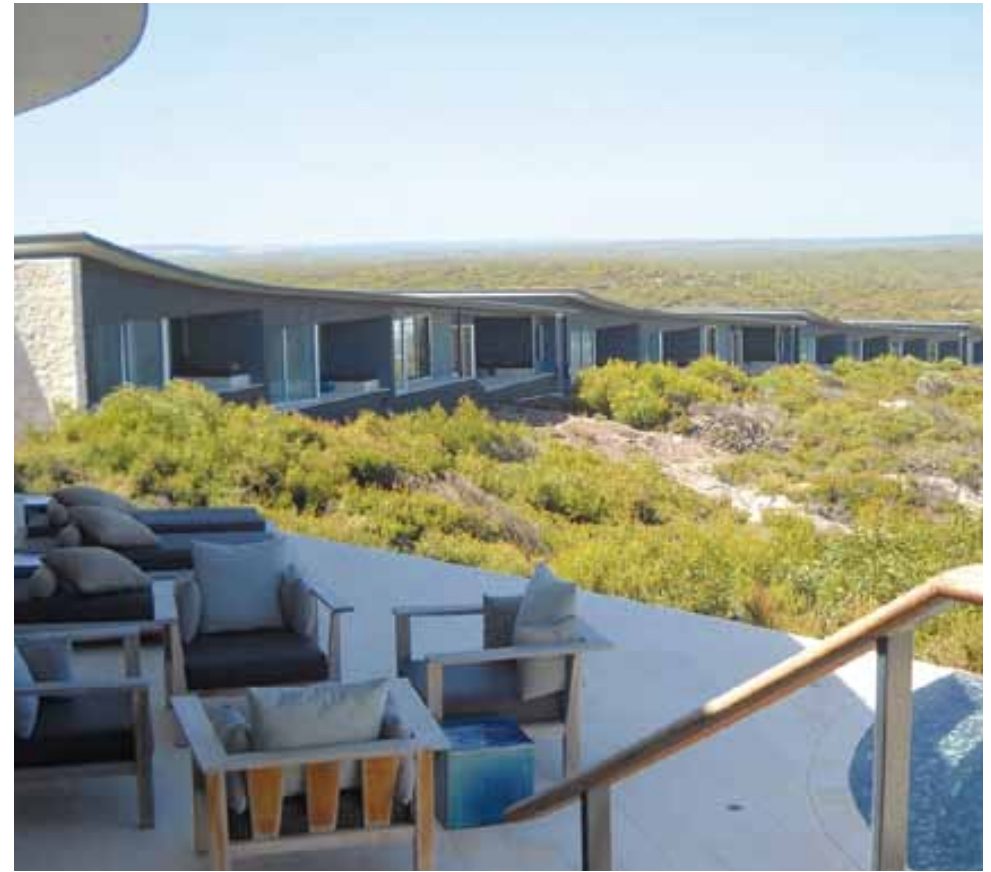
A view from the resort hotel.

We tasted about 100 different wines during our two-night stay. We also tried fresh grape juice and fresh grape straight from the vineyard. On the