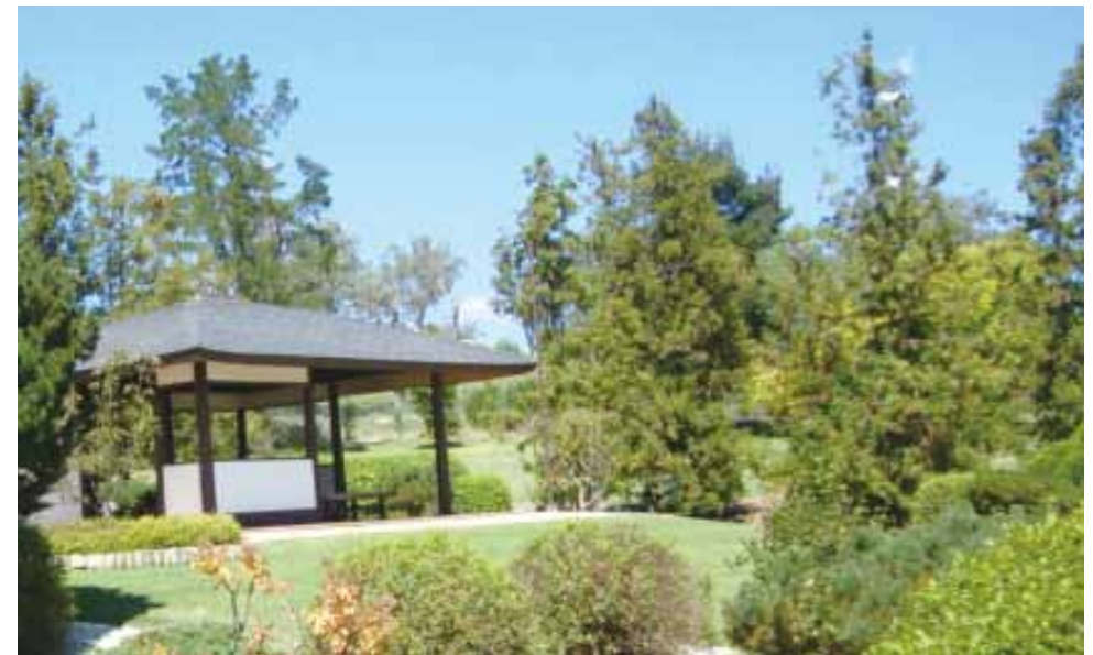
The Beautifully Maintained Japanese Garden

When you leave Sydney by car and go through the Blue Mountains, you reach Bathurst in about an hour. When you visit this area which is famous for breeding Angus cattle, I recommend that you call at the steak restaurant and pub A. J. Angus. After having a break here, thoroughly