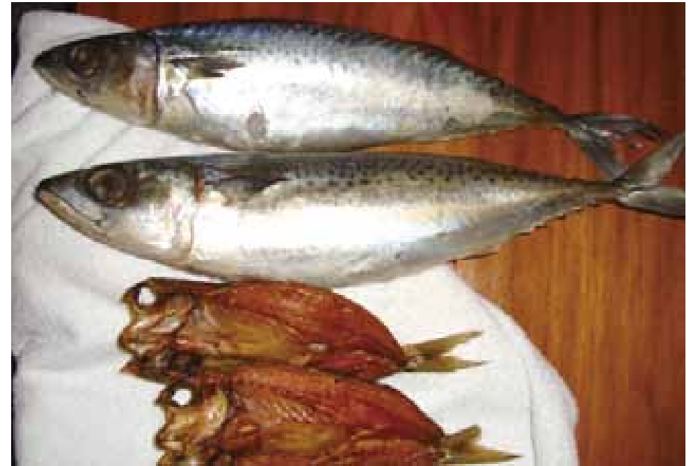
Dried yellowtail and large mackerel.

Clean Sea Company started developing technologies for tuna farming