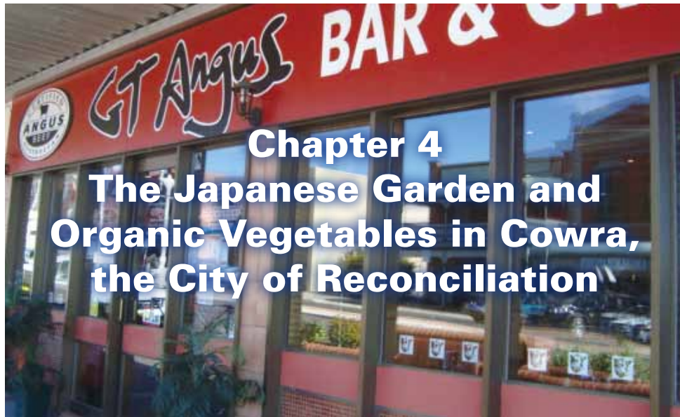
Steak Restaurant and Pub, A. J. Angus