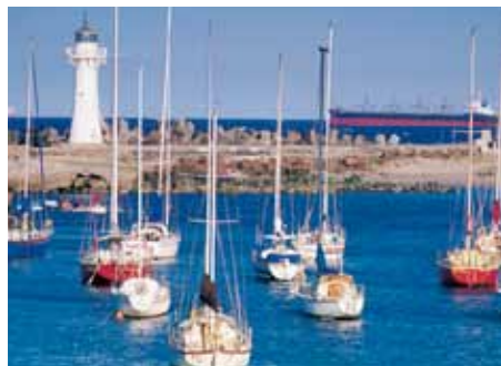
Kiama port (Tourism NSW)

After having breakfast at a café, we look around the town and take some photos at Cargo's restaurant (phone: 02 4223 2771) which stands by the sea. You can always see big pelicans here. Perfect place to visit with your partner or family. Enjoy their local seafood. Booking essential.