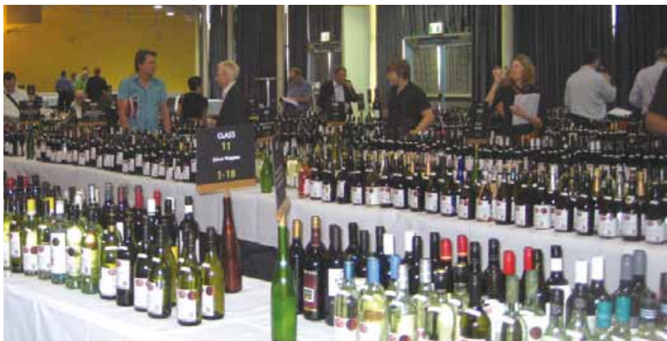
Sydney Royal Wine Show 2010