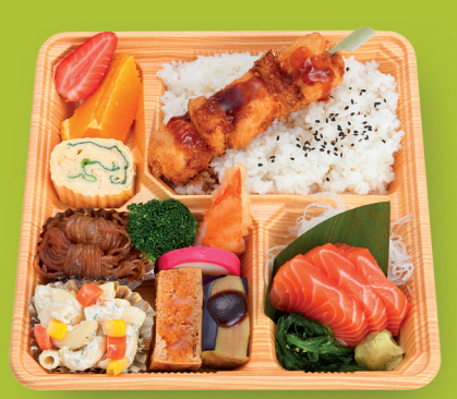
9. Mis∂ Bento $17.80