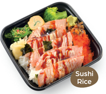
3. Aburi Salmon Don $13.00 *Salmon Sashimi Don $12.50