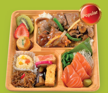
8. Ginger Pork Bento $17.80