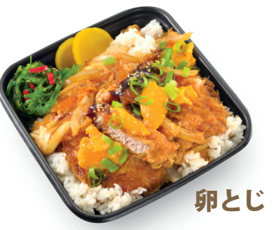
2. Pork Fillet Tama Don $12.50