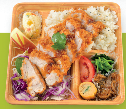
7. Chicken Katsu Bento $15.00