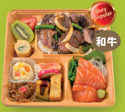
10. Wagyu Bento $19.80