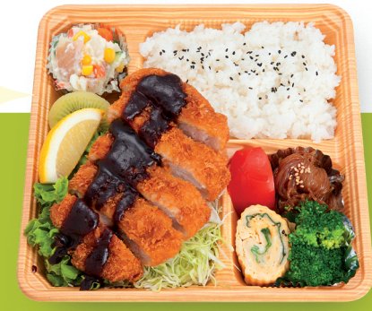
4. Miso Katsu Bento (120g) $16.00

We use all-natural Western Plain pork from Victoria (and processed in Adelaide), bred free range so it's more tender and flavourful. Only the female pigs are selected and are fed on wheat and barley to ensure a succulent flavour. The pork is covered in a fresh breadcrumb coating and deep fried with pure soybean oil. Please try our Tonkatsu, each mouthful leads to a crunchy and juicy perfection.