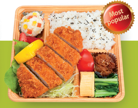
5. Tonkatsu Bento (120a) $16.00