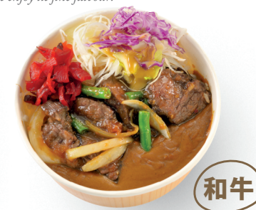
16. Wagyu Curry $14.50