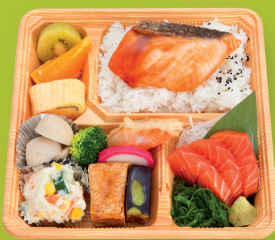
12. Salmon Bento $17.80