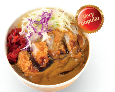
14. Pork Loin Katsu Curry $13.50

Made with caramelised sauteed onions, our Curry Spice is a Chef's special recipe. It is cooked with vegetable stock and fruit chutney, then slow-cooked overnight. Please enjoy its fine flavour.