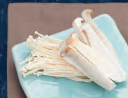
Assorted Mushrooms $12.00