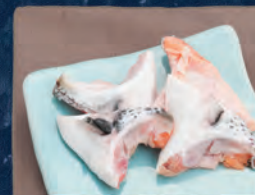
Salmon Wings $5.00/pcs