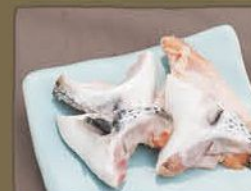
Salmon Wings $5.00/pcs