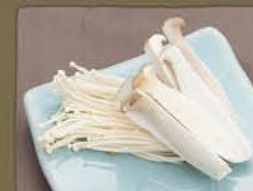
Assorted Mushrooms $12.00/pcs