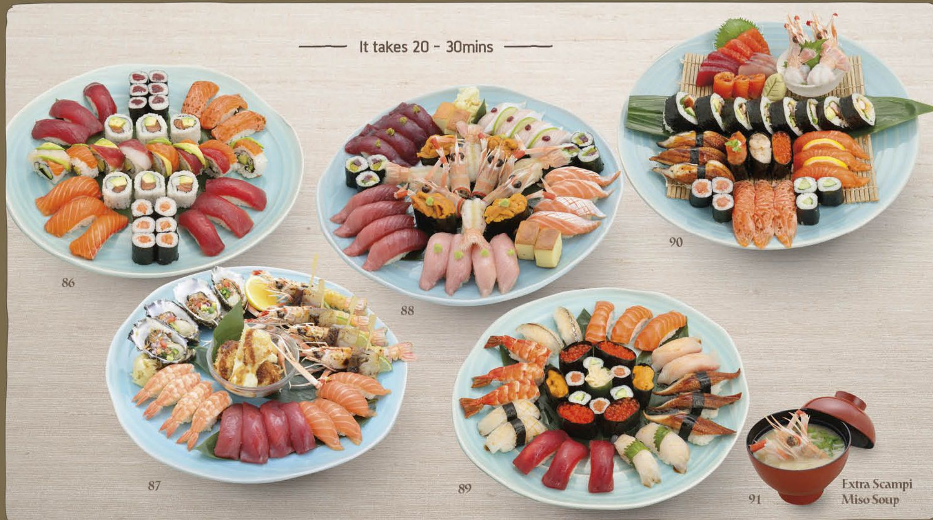
Extra Scampi Miso Soup