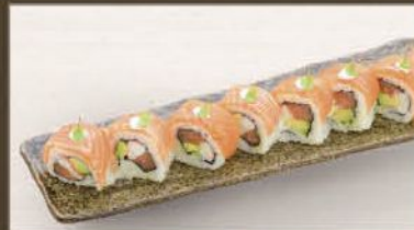
Salmon & Avocado Roll