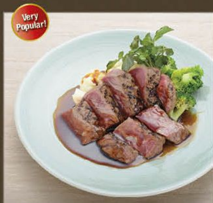
Wagyu Beef Sirloin Teriyaki