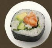
Teriyaki Chicken Roll (8pcs) 18.80 Also available