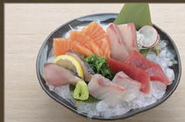
Sashimi Ocean 5