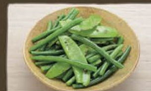
Green Beans & Snow Pea