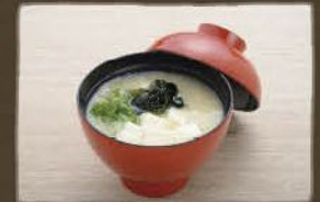
Miso Soup 3.80