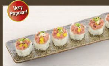
Spicy Tuna Roll

lightly cooked in pure soy bean oil served with dashi dipping sauce