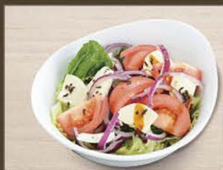
Tomato Caprese Salad

seared Wagyu beef, sliced sashimi style, crisp mizuna, beetroot with ponzu soy citrus & a touch of balsamic and black pepper