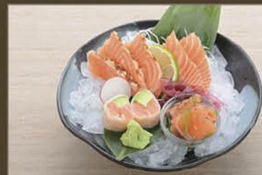
Salmon Ocean 4