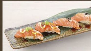
Aburi Toro Salmon