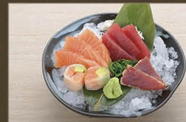
Tuna & Salmon Sashimi