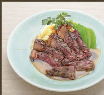
Wagyu Beef Rump Miso