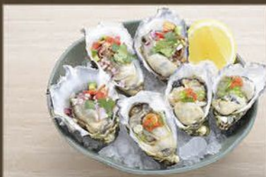
Fresh Tasmanian Oyster