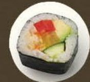
Vegetarian Roll (8pcs) 16.80 Also available