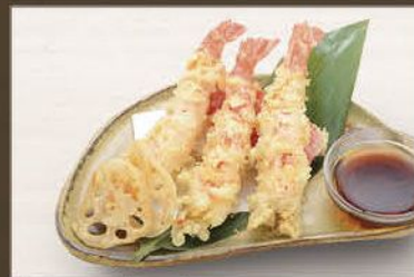
Tempura King Prawn