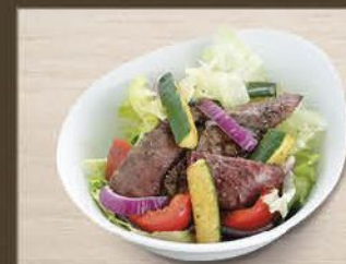
Wagyu Yakiniku Salad