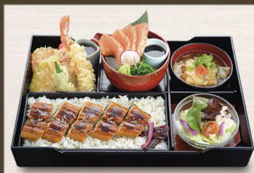
BBQ Eel Bento