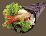
Tempura King Prawn