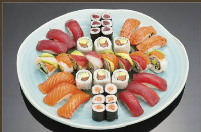
Tuna & Salmon Lover's Platter

best choice for lovers of tuna, salmon, seared salmon, salmon avocado roll and rainbow roll