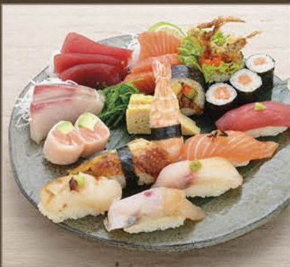
Sushi & Sashimi