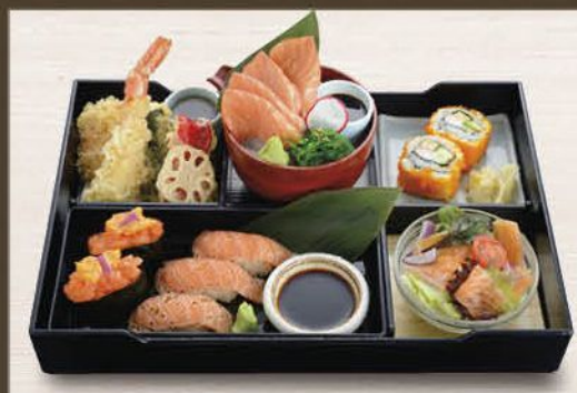
Salmon Lover's Bento

bbq eel on bed of steamed rice, assorted tempura, salmon sashimi, deep-fried tofu with special dashi broth & green salad