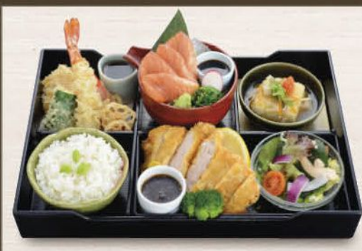
Tempura Tonkatsu Bento

vegetable chirashi, eggplant with miso paste, deep fried tofu with special dashi broth, truss tomato caprese and steamed vegetables