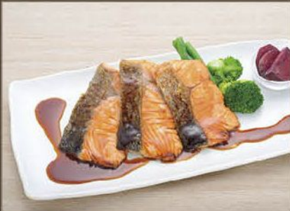
Teriyaki Tasmanian Salmon