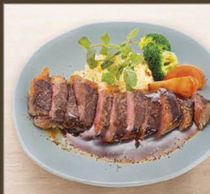
Teriyaki Angus Sirloin Steak