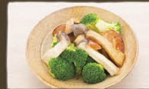
Teriyaki Mushroom & Broccoli