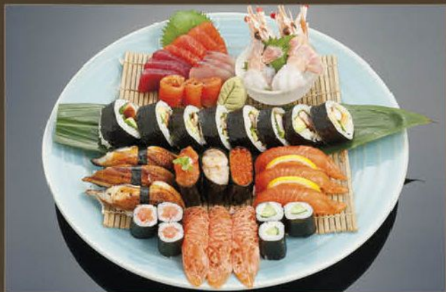
King & Queen Platter

excellent combination of assorted sushi & sashimi platter including scampi, tuna, salmon, eel & teriyaki chicken avocado roll