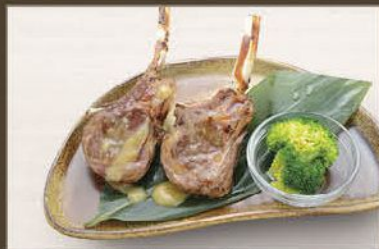
Lamb Cutlet Masuya Style