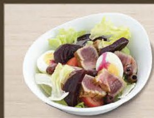
Masuya Tuna Salad