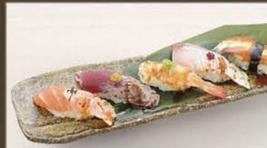
Aburi Sushi Entrée