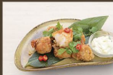
Karaage Chicken Namban Style