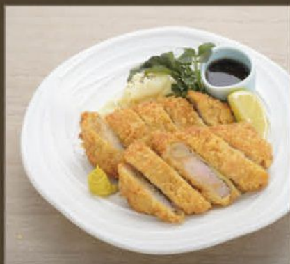
Tonkatsu Pork Loin