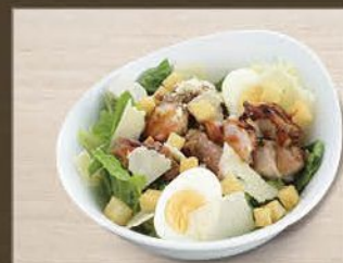
Chicken Caesar Salad