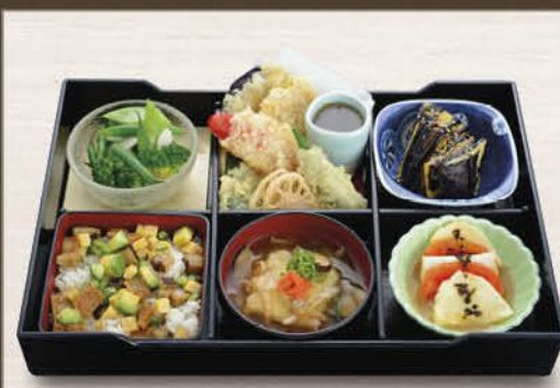
Veggie Lover's Bento

* 当店では、シェフが朝一に仕入れたこだわりのマグロ、ウニ、地魚各種を別メニューにてご案内しております。豪州シドニーの握り寿司をアラカルトでぜひお楽しみください。