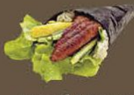
Unagi Masuya Roll