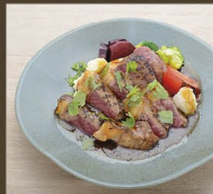
Angus Steak Masuya Style