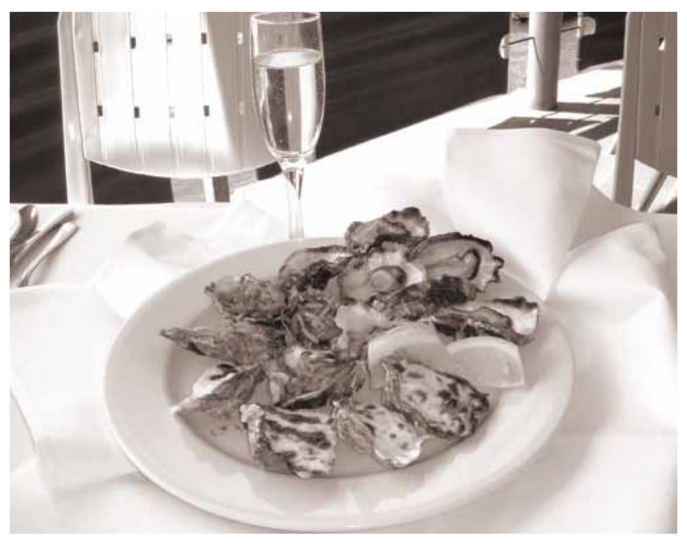
Clockwise from the top, Natural oyster, Morney and Kilpatrick

About 500km of coastline north of Port Stephens is so-called the Holiday Coast by Australians and along the coast you can enjoy sandy white beaches, lovely forests and the clear blue sea. As you can see, the tour of Rock Oyster is exactly the same as touring on the Holiday Coast. The working holiday makers staying in Sydney and on the Gold Coast for a long time - please get out of there! Look for work like mad along the Holiday Coast and study spoken English! For example, it is a good idea to work on an oyster farm. A different Australia you've never seen is waiting for you!