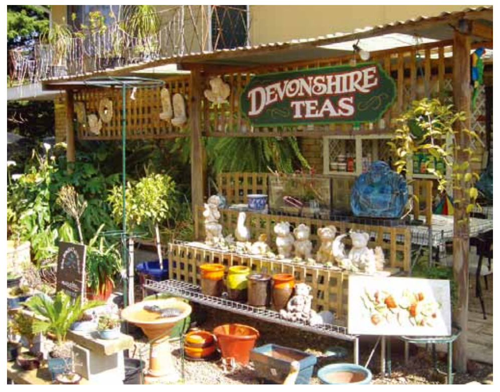
"Bellbrook Nursery Tea Shop" near the A. T. Farm, I often drop in

IT is in the heart of the mountains near the A. T. Farm. There grows lots of flowers in the front garden and sells local eggs and homemade jams. I always bring the staff here. A fifty year old lady, runs the shop by herself, surrounded by mountains and many species of birds. The chickens are free to roam, so I wonder if they could escape? I sometimes think if other big birds would be able to swoop down and attack the baby chicks. How can different birds with different lives live together in the one area? I have asked my own staff this question but no one has ever been able to give me an answer. Maybe... because of the lady's absolute love for the birds...? It is hard for us to love all sorts of people, would I be able to love all 120 staff members? I would often become a demon when I am at work, and scold the staff severely but when I come up here, I often think, is this the right attitude...?