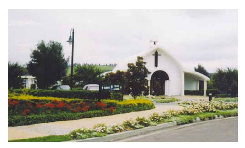
The white church of Hunter Gardens

attention in Australia, which has become successful in a short period. Its concept, design of the shop and wine bottles, marketing and sales promotion, all under a young manager, "Tempus Two" is expected to be a winery which can cope with great international attention. In addition, Cypress Lakes Resort is popular among Japanese people, along with the golf course that Greg Norman designed as well as the many galleries in Hunter Valley.