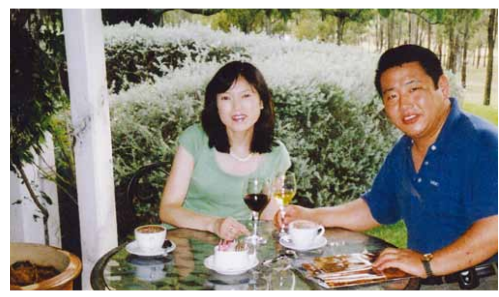
20th of February, celebrating wife's birthday at Peppers Guest House

Recently, many weddings have been conducted here in Hunter Valley. There is the "Wyndham Estate", "Tatler Vineyard" and "Lindemans Winery" which are able to accommodate 300 people