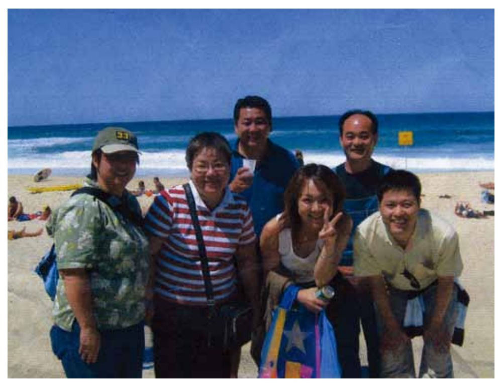
At a BBQ party with staff who established Makoto at Bronte Beach