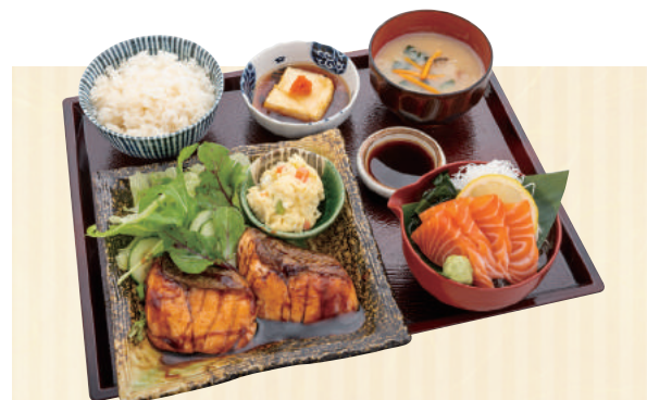
3 TERIYAKI SALMON AND SASHIMI SET $25.00

Nigiri and roll sushi with teriyaki chicken (180g) with miso soup