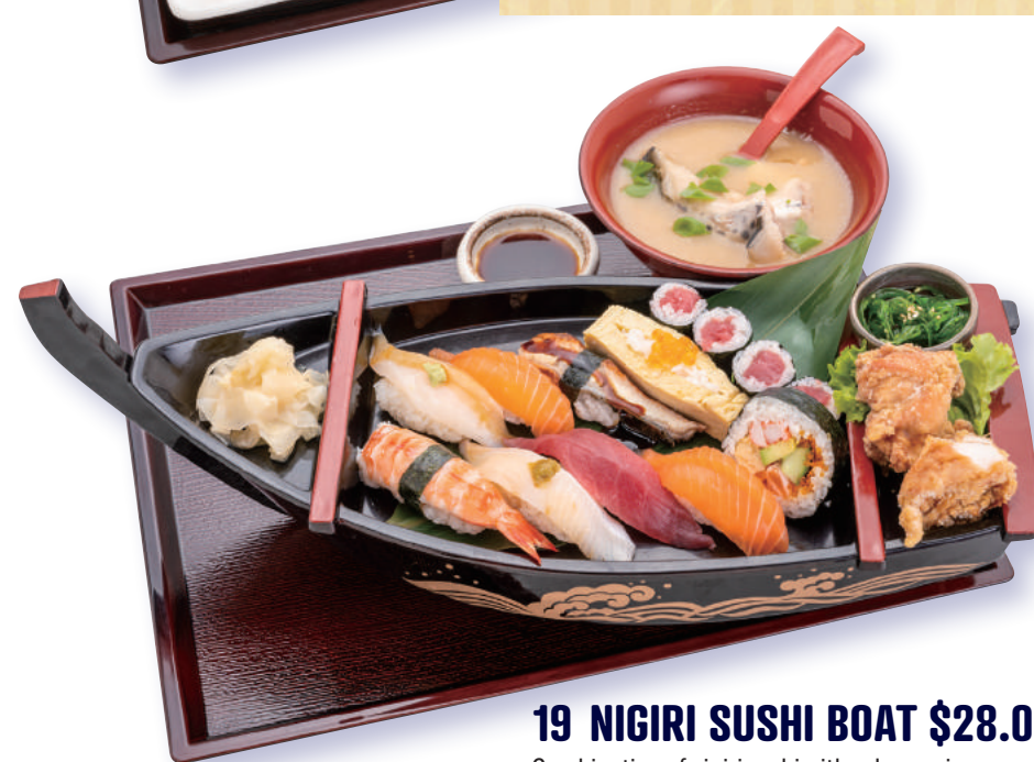
19 NIGIRI SUSHI BOAT $28.00

PLEASE CHECK OUR DISPLAY OR ASK OUR FRIENDLY STAFF FOR INFORMATION