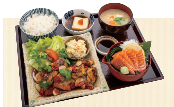
9 TERIYAKI CHICKEN AND SASHIMI SET $25.00

Teriyaki salmon, with salmon sashimi (4pcs), agedashi tofu, steamed rice and miso soup