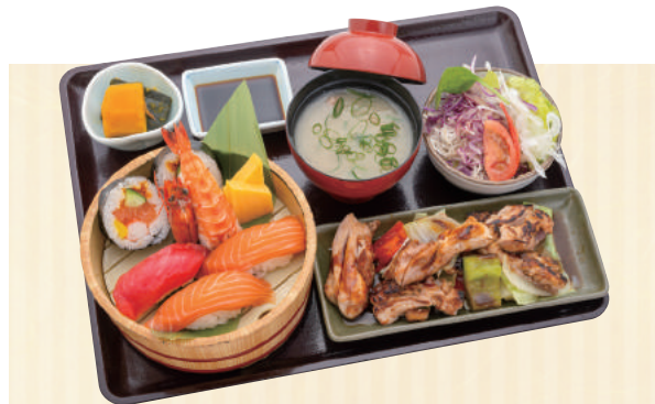
16 SUSHI AND TERIYAKI CHICKEN SET $26.00

BBQ eel on steam rice, with salad, miso soup and ice cream