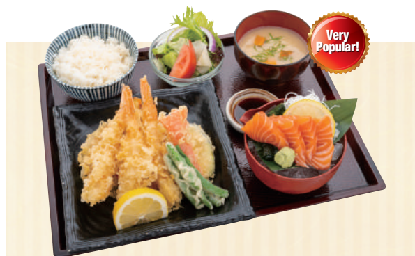
1 TEMPURA AND SASHIMI SET $25.00