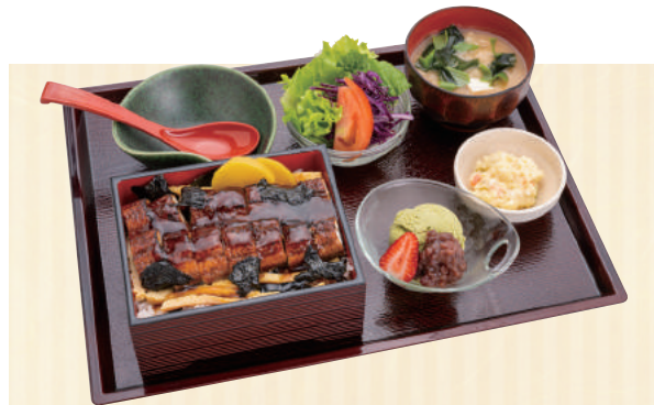
13 UNAJYU SET $27.00

Sauteed pork belly with ginger and soy sauce, with salmon sashimi (4pcs), agedashi tofu, steamed rice and miso soup