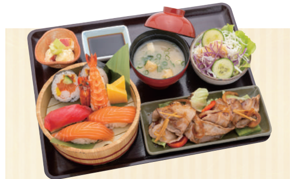
17 SUSHI AND SHOGAYAKI PORK SET $26.00

Wagyu yakiniku (180g) on steam rice, with salad, miso soup and ice cream