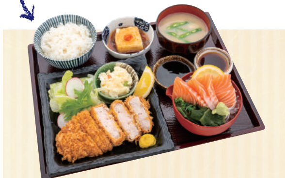
5 TONKATSU PORK LOIN AND SASHIMI SET $25.00

GRILLED SALMON AVOCADO SUSHI ROLL (EXTRA $2.00) INSTEAD OF STEAMED RICE