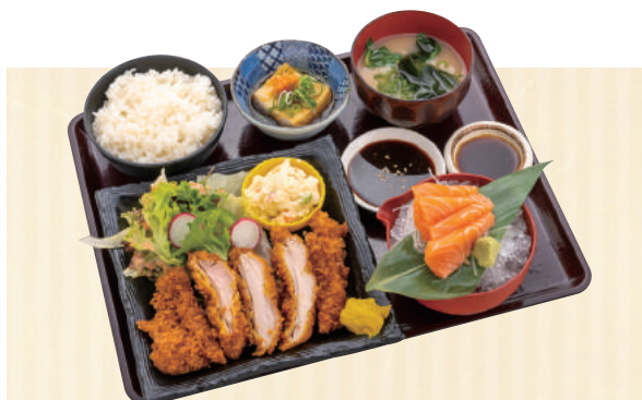
11 CHICKEN KATSU AND SASHIMI SET $25.00

Deep fried pork loin katsu, with salmon sashimi (4pcs), agedashi tofu, steamed rice and daily changing miso soup