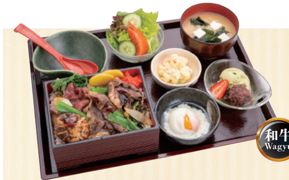
15 WAGYU SUKIYAKI SET $28.50

Deep fried chicken katsu, with salmon sashimi (4pcs), agedashi tofu, steamed rice and daily changing miso soup