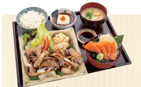
7 SHOGAYAKI PORK AND SASHIMI SET $25.00

King prawn, crab stick, and assorted vegetable tempura, with salmon sashimi (4pcs), steamed rice and miso soup