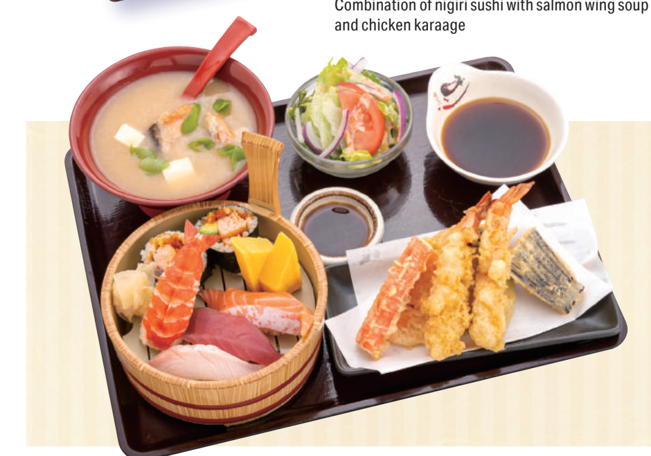
20 SUSHI TEMPURA AND SALMON MISO SOUP SET $28.00

Combination of nigiri sushi with salmon wing soup and chicken karaage