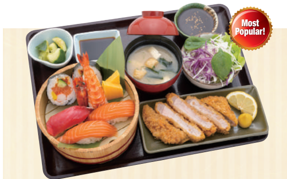
18 SUSHI AND TONKATSU PORK SET $26.00

Sliced wagyu (180g) with our sukiyaki sauce, with salad, miso soup and ice cream