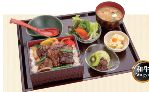
14 WAGYU YAKINIKU SET $28.50

Teriyaki chicken thigh fillet (180g), with salmon sashimi (4pcs), agedashi tofu, steamed rice and miso soup