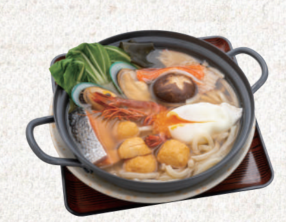
SERFOOD UDON $19.50

Assorted seafood (prawn, mussel, fish ball, salmon fillet) and seasonal vegetable udon noodles serve in hot pot