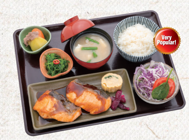
TERIYAKI SALMON SET

Chicken thigh fillet (200g) and season vegetable with homemade teriyaki sauce