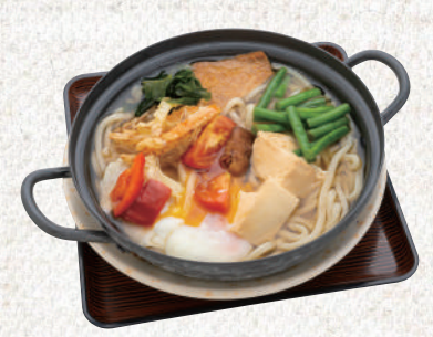
VEGETABLE UDON $17.50 Season vegetables & poached egg udon noodles serve

Assorted seafood (prawn, mussel, fish ball, salmon fillet) and seasonal vegetable udon noodles serve in hot pot