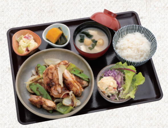
TERIYAKI CHICKEN SET

•SASHIMI AND TERIYAKI CHICKEN SET $26.50