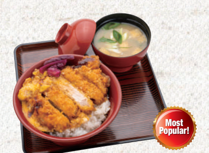
PORK KATSU TAMA DON SET $18.50

Pork loin katsu (130g) with savoury egg sauce on top of