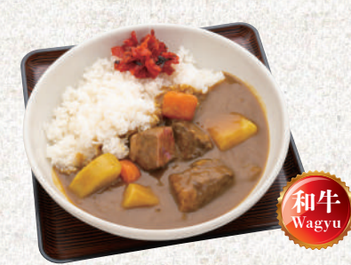
WAGYU BEEF CURRY Wagyu beef with homemade curry and pickles