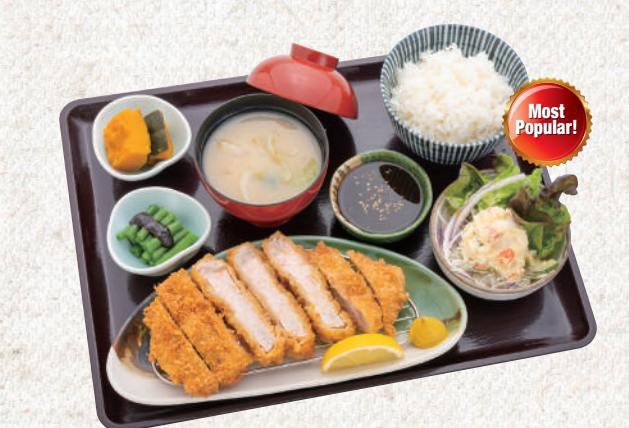
TONKATSU PORK LOIN SET

Selected free range pork loin (170g) cook in vegetable oil