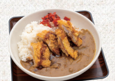
CHICKEN KATSU CURRY $18.50 Chicken cutlet with homemade curry and pickles