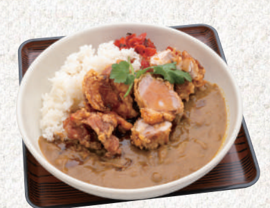
KARAAGE CHICKEN CURRY $18.50 Deep fried chicken with homemade curry and pickles