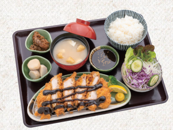
MISO CHICKEN KATSU SET

Selected free range pork loin (170g) cook in vegetable oil