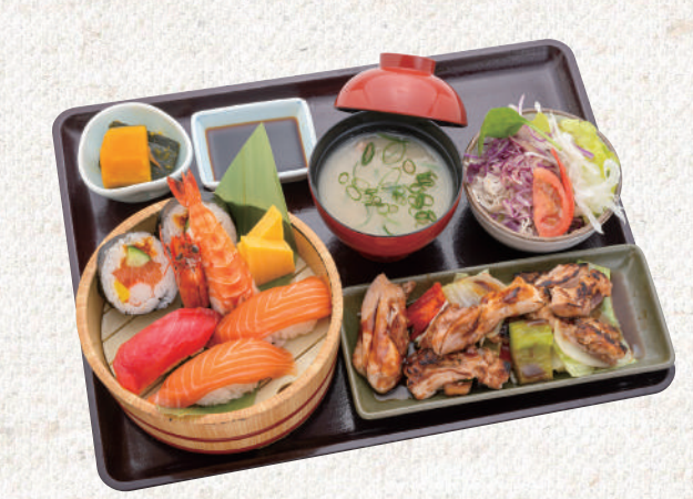
NIGIRI SUSHI AND TERIYAKI CHICKEN SET .....$25.00

Nigiri and roll sushi with teriyaki chicken