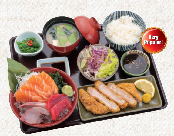
SASHIMI AND TONKATSU PORK SET $27.50

Selected free range pork loin (170g) serve with savoury soy and mirin egg sauce