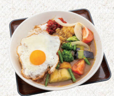
VEGETABLE CURRY $17.50

Seasonal vegetables (broccoli, eggplant, carrot, potato) curry with fry egg