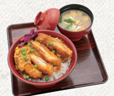
CHICKEN KATSU TAMA DON SET $18.50

Chick thigh fillet with homemade teriyaki sauce on top of Japanese steam rice