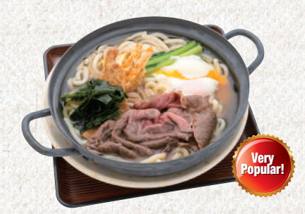
NABEYAKI UDON $18.50

Season vegetables and sukiyaki beef udon noodles serve in hot pot