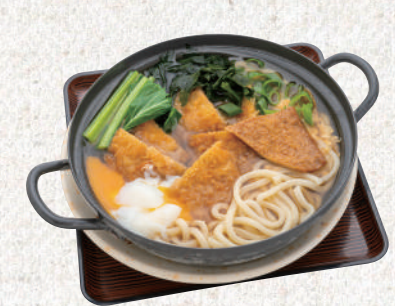
FILLET KATSU PORK UDON $18.50 Deep fry pork tenderloin udon noodles serve in hot pot

Season vegetables and sukiyaki beef udon noodles serve in hot pot