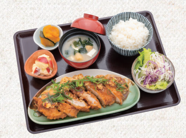
PORK KATSU TAMA SET -$19.80

$19.80 Chicken thigh fillet (170g) serve with original miso paste