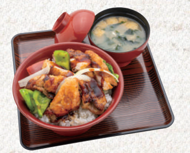
TERIYAKI CHICKEN DON SET $18.50

Pork loin katsu (130g) with savoury egg sauce on top of